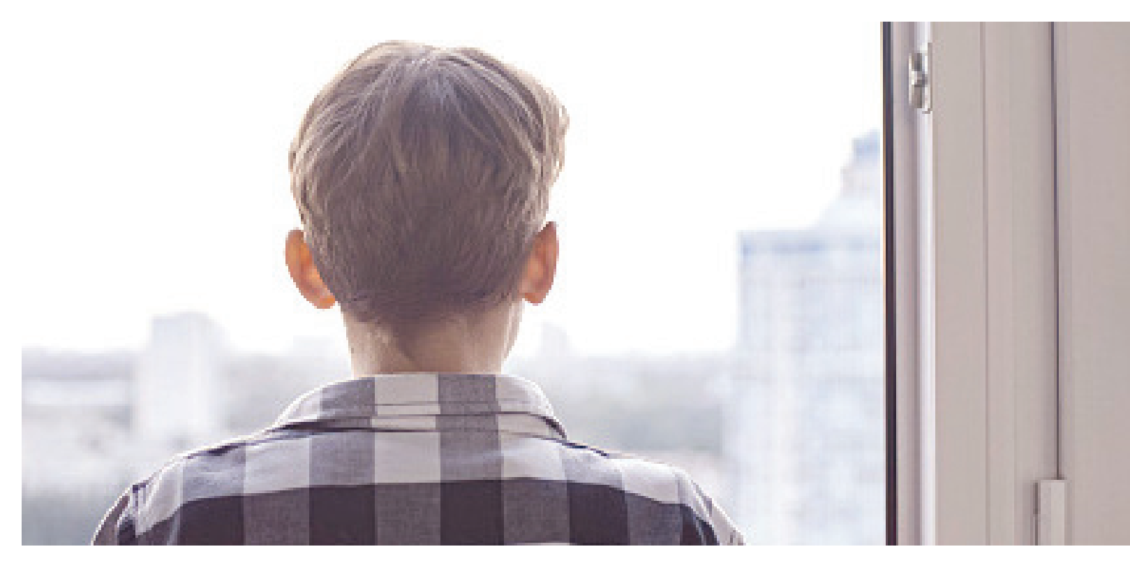
<sup>5</sup> (Allostatic load refers to the cumulative burden of chronic stress and life events). <sup>6</sup> A positive or accelerated epigenetic age occurs, when an individual's DNA methylation-predicted age is older than their chronological age.

Food poverty, fuel poverty, period poverty, clothing poverty, digital poverty and homelessness, all have